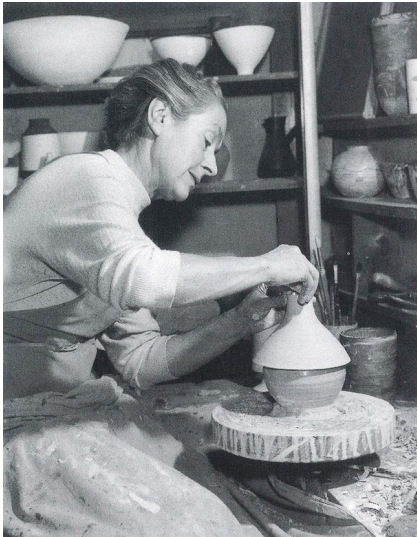
08: Lucie Rie